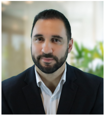
Frank Griffin Flat Rate Realty Group

Come take a tour of this spacious 2 bedroom 2 bathroom Condo in central Colorado Springs. Location, location, location! This property is right next to tons of amenities to include grocery, a plethora of restaurants, fast food, and retail stores on Austin Bluffs Pkwy and Academy. The townhome is also near Memorial hospital and major parks such as Palmer Park, and just a short drive away from Garden of the Gods and other leisure spots. Inside there is a spacious living room with cozy fireplace, great size kitchen has gas stove, with ample cupboard and counter space, and attractive wood floors. Cute peek a boo window from kitchen to living room. Outside back patio area. This Condo is in an ideal location, next to all major amenities, giving you quick access to everything you need! Don't miss your chance to come take a look!