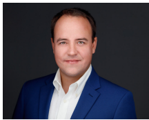
Brandt Ellwood Elite Home Partners

Welcome home to this pet-friendly condo with walk-out access to the pool area! The galley kitchen is perfect for the home chef. Just blocks away from Trader Joe's and Snooze as well as other fantastic shopping and dining within walking distance including the exciting 9th & Colorado development. The sliding glass door opens directly to the pool deck. This secure building with intercom access boasts a separate storage area. The professionally managed HOA includes water, heat, pool, roof, and exterior maintenance. If you're looking for a great condo in a prime location - look no further!